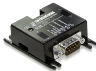
Microstepping Driver R208