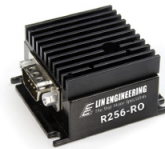
Single Axis Controller + Driver R256-RO